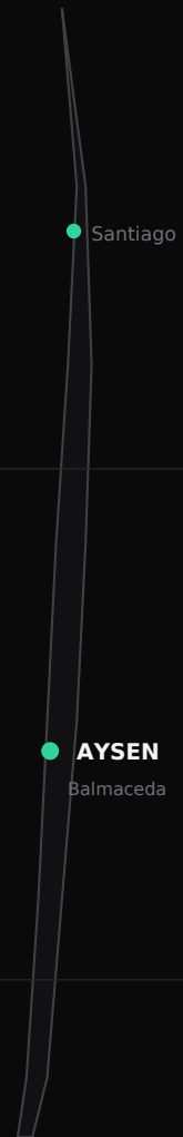
CHILE · SOUTH AMERICA